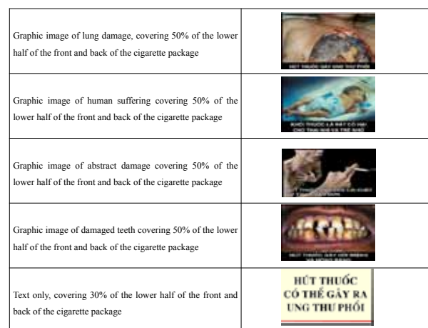
Figure 1. GHW Designs Used in this Study

To predict the impact of GHWs on the reduction of premature smoking-associated deaths as a result of GHWs, we constructed different static models. We adapted the method developed by University of Toronto, Canada (Used in the research “Tobacco Taxes: A Win-Win Measure for Fiscal Space and Health” (Asian Development Bank, 2013)). We evaluated the impact of different GHW labels on cigarette packaging on reducing the number of smokers. The reduction in the number of smokers was then converted into prevented smoking-related mortality. The prediction exercise was conducted in two steps. The parameters and assumptions used in the prediction are